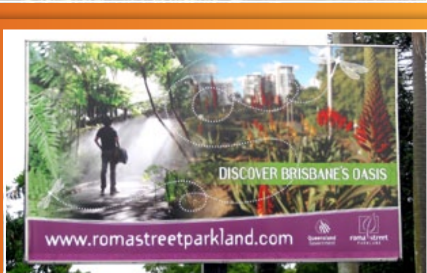
▲ Here the flowering aloe-aloe varieties are seen on a sign welcoming visitors to Roma Street Parklands in Brisbane where over the recent three years they have drawn many visitors to the parklands.

Visiting Australia's botanic gardens is a great way to see how new plants can be used in gardens. These aloe-aloe varieties are now able to be seen in botanic gardens in most capital cities of Australia and in many public gardens in smaller towns. Sydney-siders will benefit from a new 500m 2 garden comprising of the aloe-aloe varieties currently being constructed by the Royal Botanic Gardens so as to provide visitors to the gardens with a warm kaleidoscopic display of autumn and winter colour.