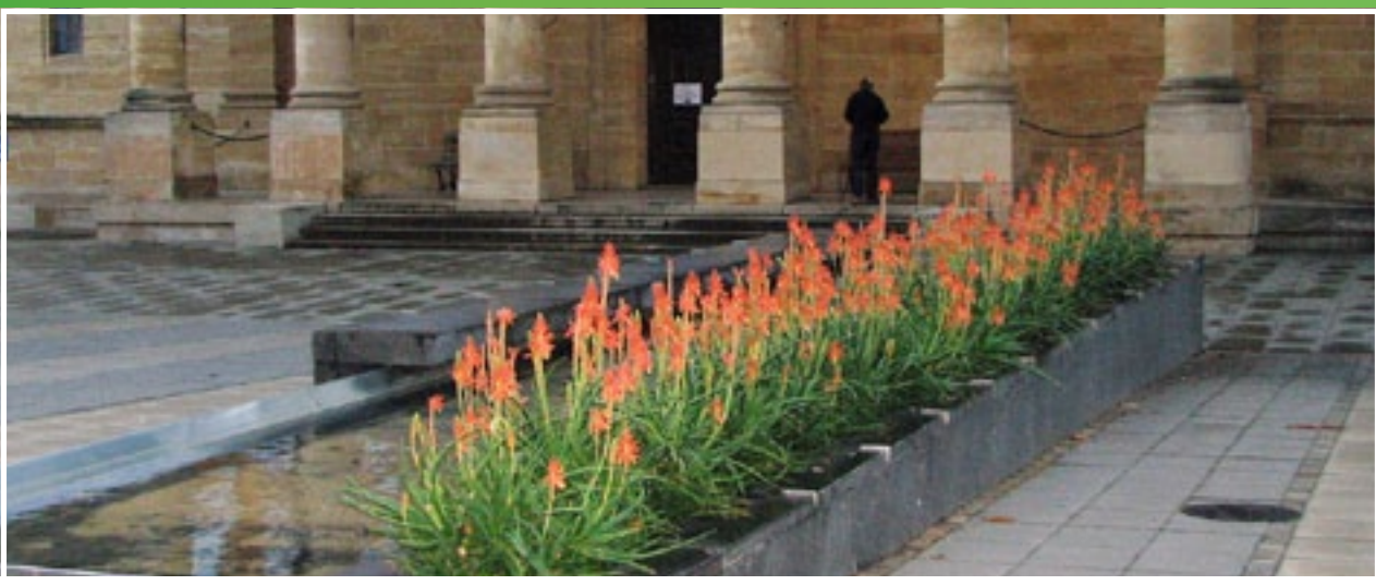
In Adelaide the grass aloe Topaz provides a recurring grow of orange each winter in front of the Art Gallery of South Australia .

City councils, under constant pressure from rate payers to beautify streetscapes, need to do so as economically as possible. The plants that they use need to offer predictability, and be able to survive and look good under a range of climatic conditions. Many less robust plants including many native plants used by councils historically, have struggled to flourish without precious water and ratepayers are increasingly unwilling to fund their replacement every time mother-nature decimates them. Because of their ability to provide colour each year in tough conditions with little maintenance, aloes have long been a favourite of councils for public spaces and alongside roads in their native South Africa. It is great to see this trend now emerging in Australia. Forward thinking developers, roads departments and city planners are learning first hand that it is possible to have colour without having to undergo expensive ongoing maintenance and replacement of failed plants in dry or wet times.