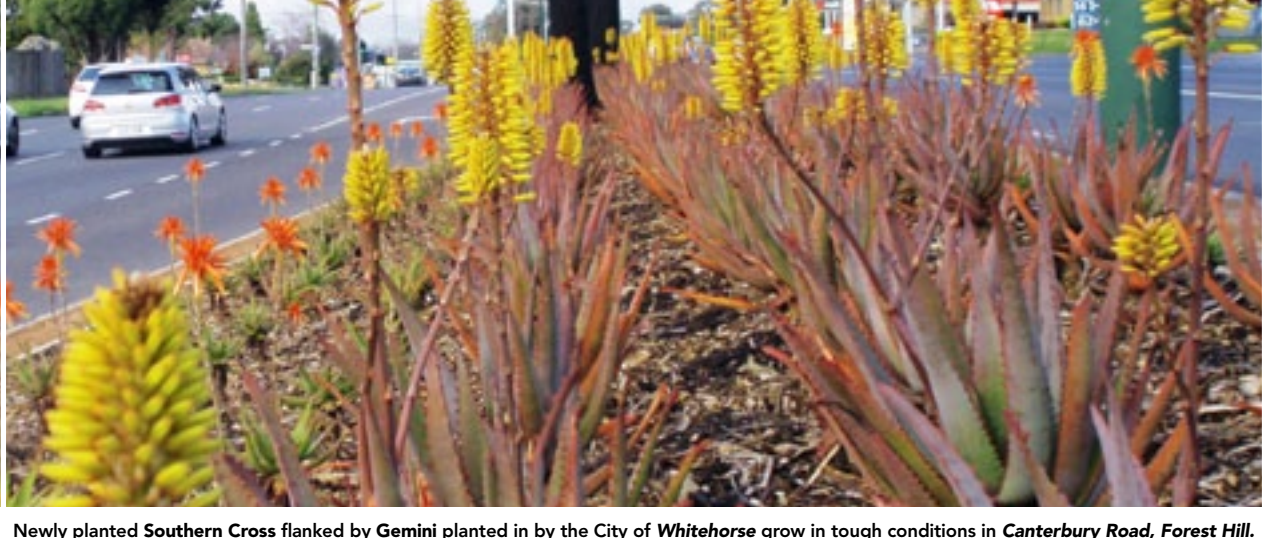
Newly planted Southern Cross flanked by Gemini planted in by the City of Whitehorse grow in tough conditions in Canterbury Road, Forest Hill .